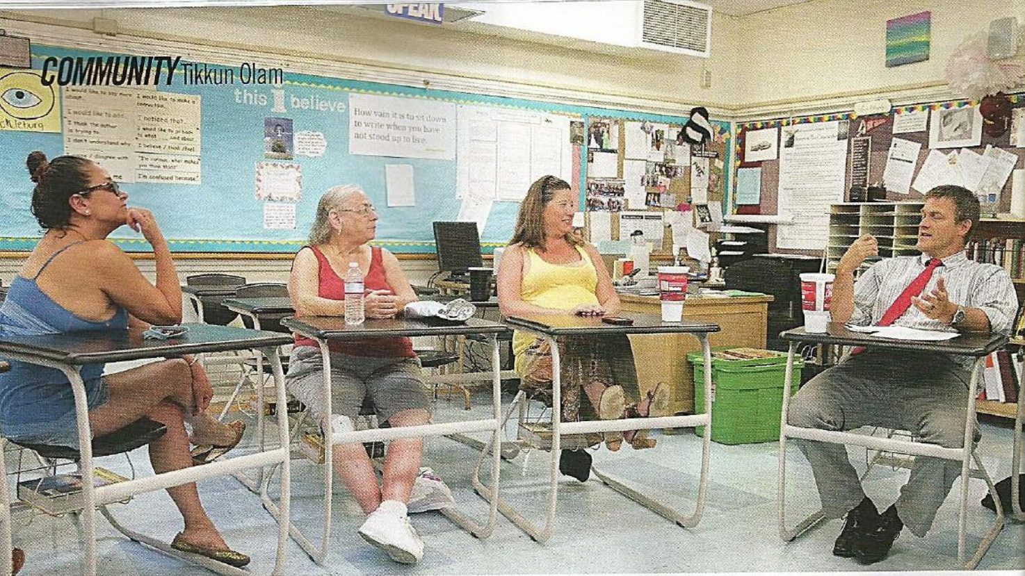
Parents discuss the week's successes and failures during a Because I Love You meeting at Granada Hills Charter High School.